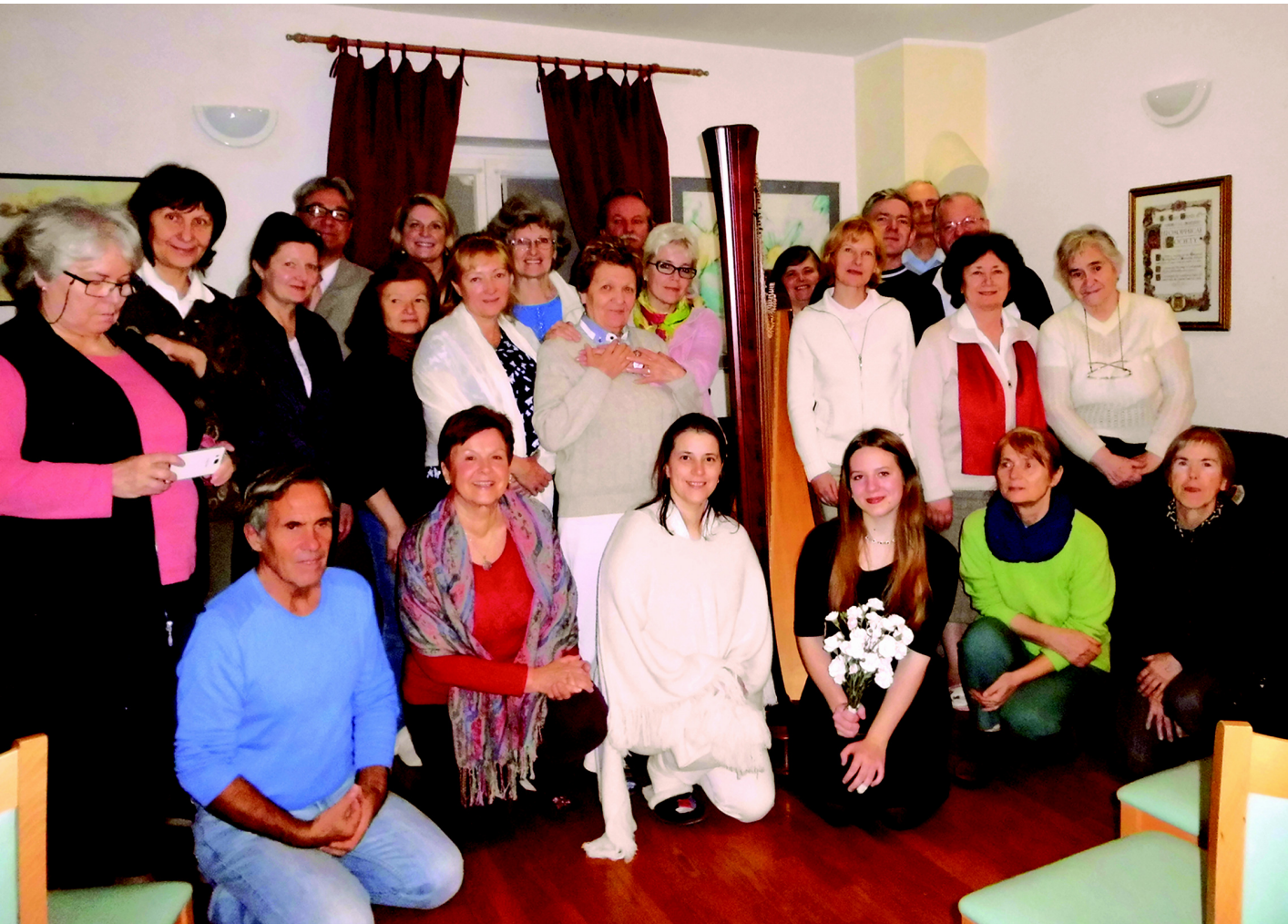
Participants in the Winter School of the TS in Slovenia, which took place near Koper, from 9 to 11 February, after an evening programme with a harp musician (holding flowers)