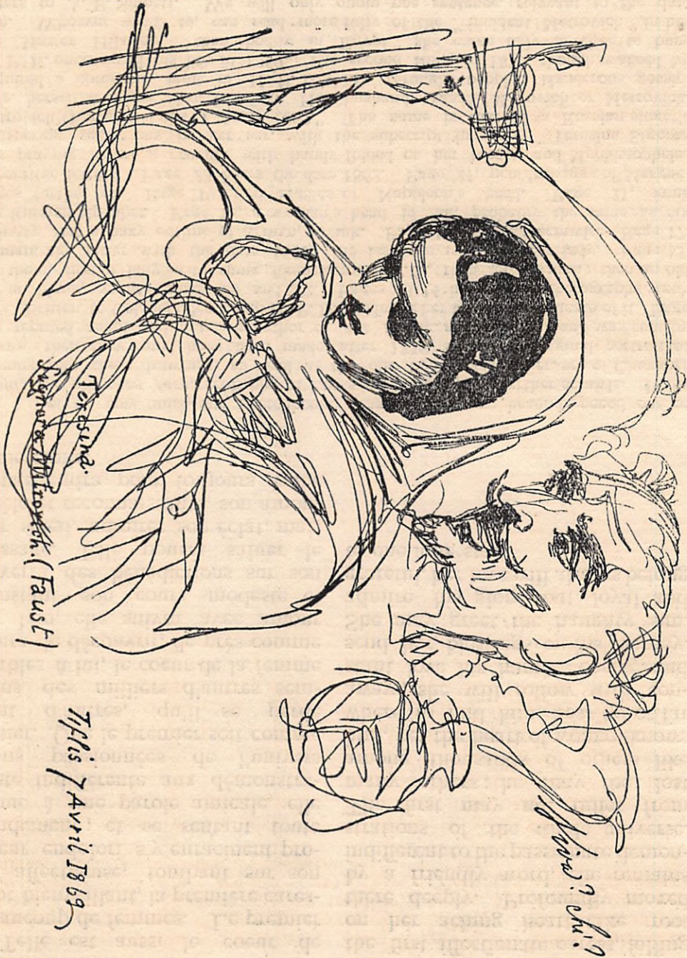
Page 24 of H. P. B.'s Sketchbook