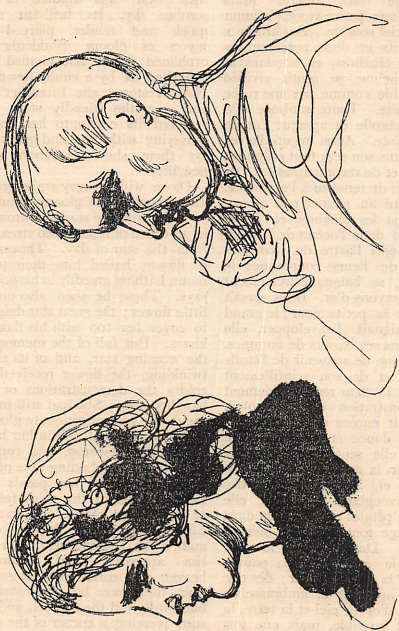
From pages 18 and 19 of H. P. B.'s Sketchbook