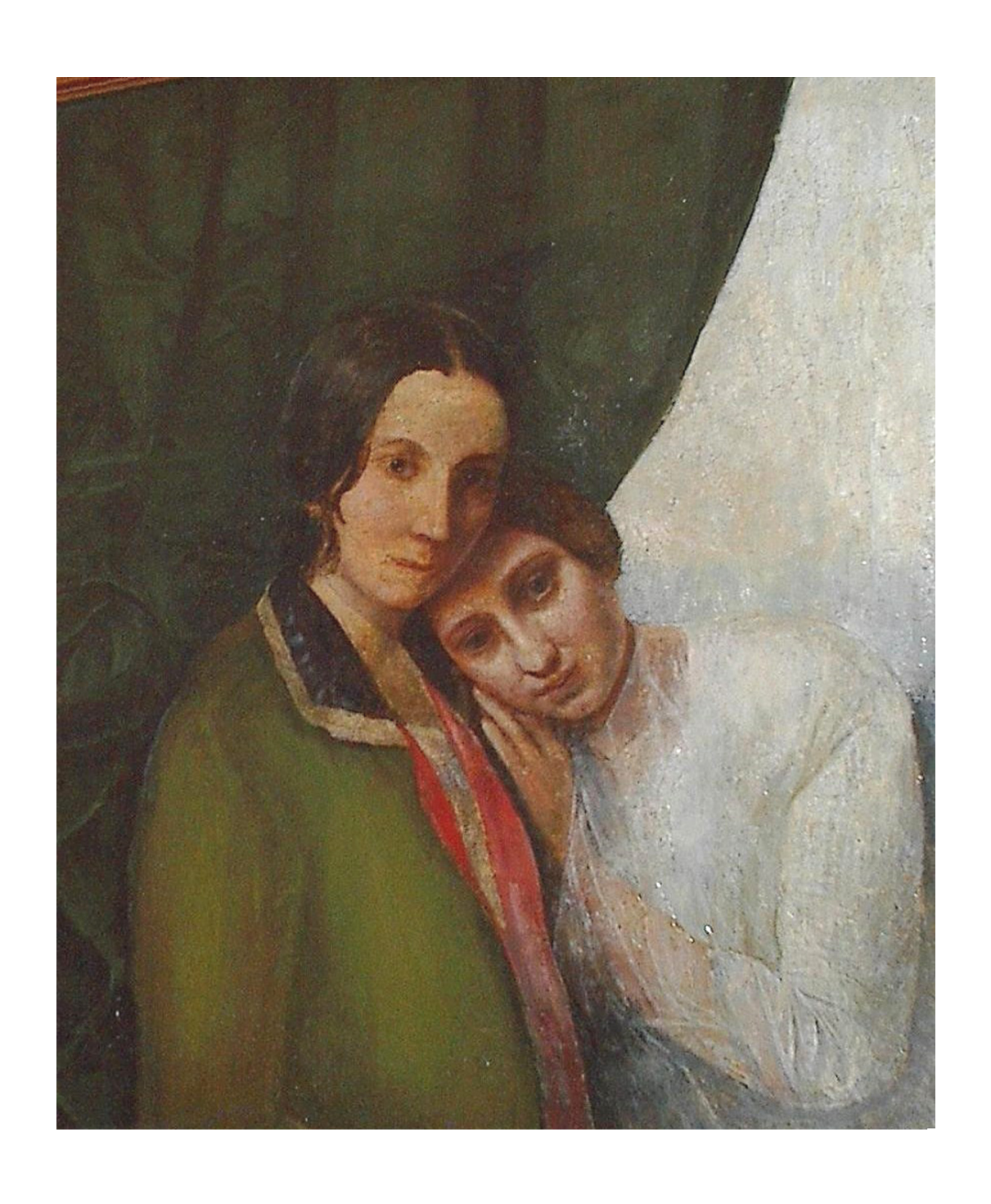
HPB with her mother