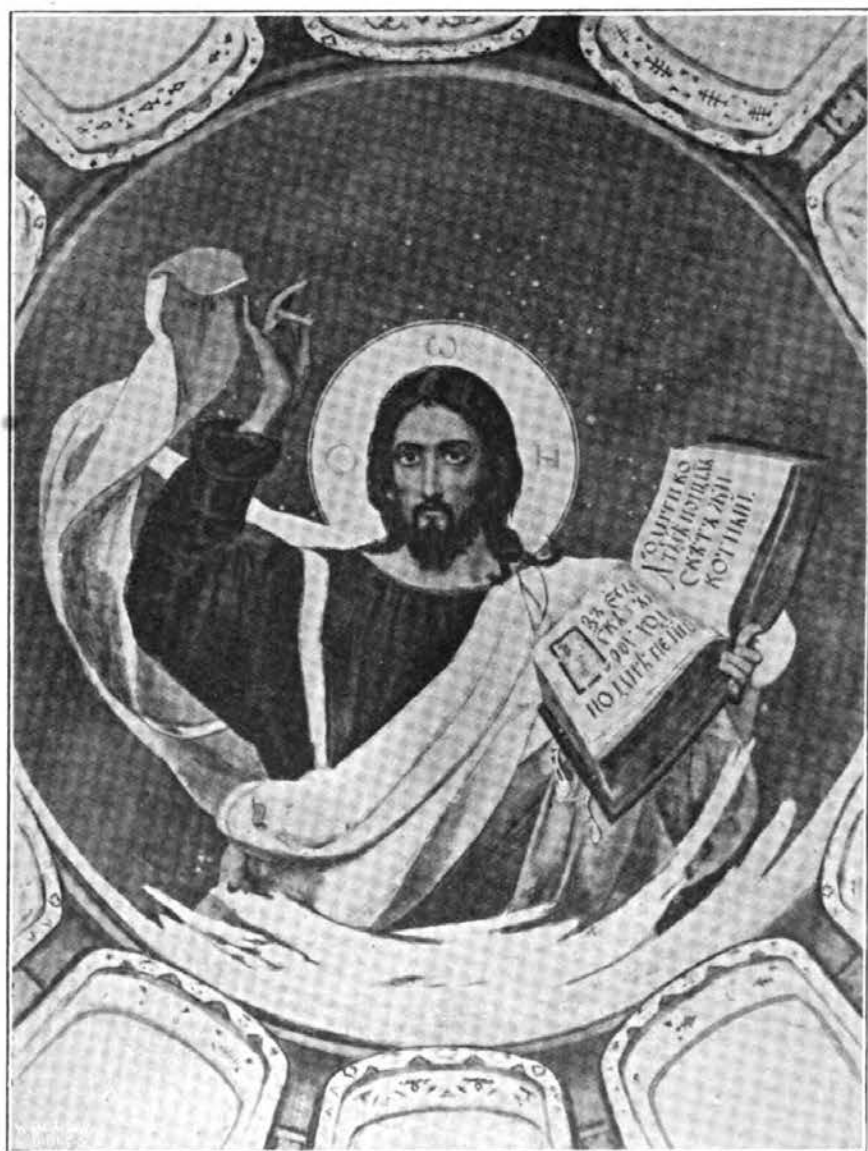
A PICTURE OF THE CHRIST