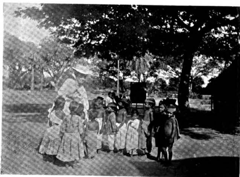
CHITRA AND BROWN BABIES.