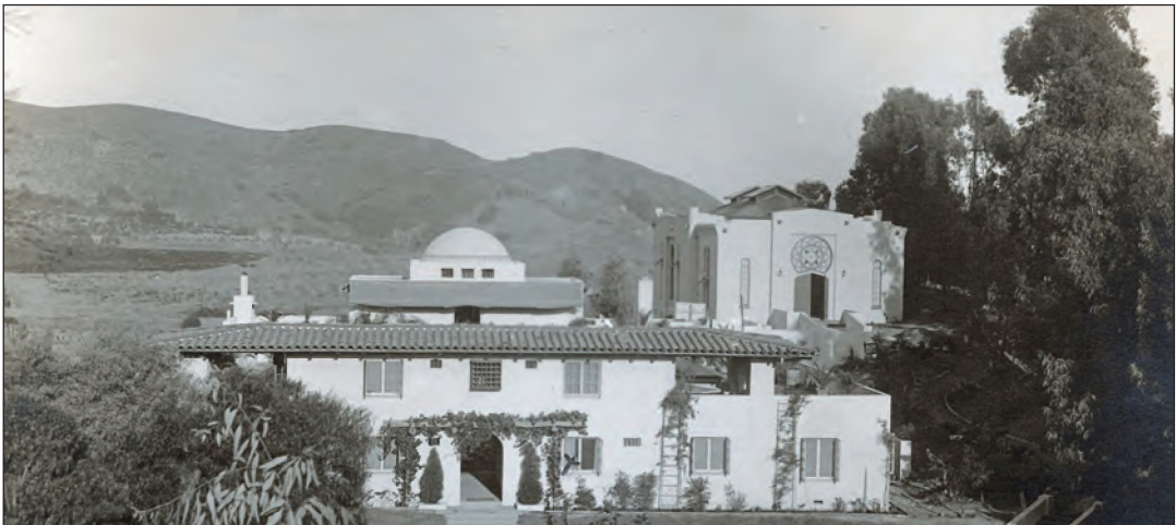
Krotona Court was located under the Hollywood sign in Beachwood Canyon. It was the first building established in Krotona Hollywood. Behind it to the right is the Temple of the Rosy Cross which was added later as a venue for masonic rites and large gatherings.