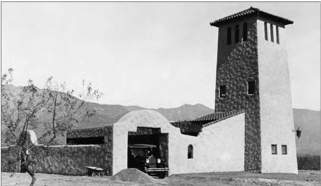
The Krotona Tower shortly after it was built in 1924. Once used as a water tower, it sits on the highest part of Krotona Hill in Ojai, in the heart of the upper residential loop.