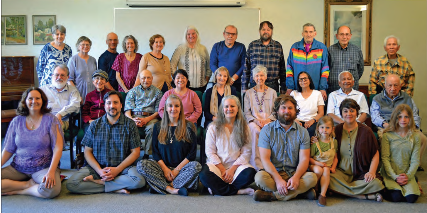
Krotona: 100 Years in Ojai