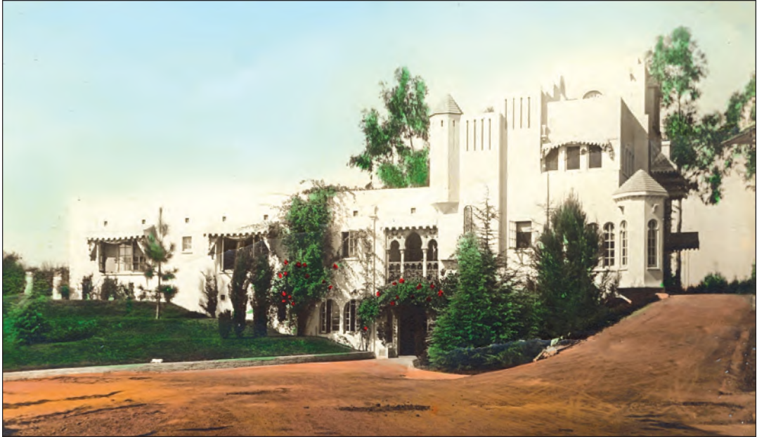
The Ternary consists of a series of three buildings. Built in 1915, it was just one of the magnificent structures in Krotona Hollywood incorporating Spanish and Moorish elements. It housed important members of the Krotona community.