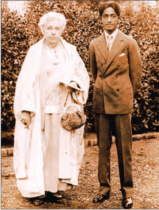
Annie Besant first visited Krotona with J. Krishnamurti. She had the vision that Ojai would become the birthplace of a more spiritually awakened humanity.