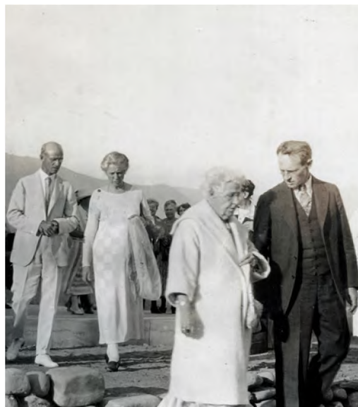
Annie Besant leaving the Krotona library veranda after giving her first talk in Ojai on her birthday, 1 October 1926.

To Besant, diversity is essential to life and our differences should not affect the feeling of kinship we must have with one another. She stressed that even a partial recognition of the truth of our interconnectedness would bring a tremendous change in the world. "Wars would cease. Mutual sympathy and help would replace criticism and condemnation. Selfishness would become the only sin," she stated. It is the solution to much human misery and her message is as true today as it was a century ago.