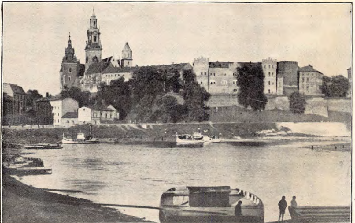
THE CASTLE OF WAWEL, CRACOW