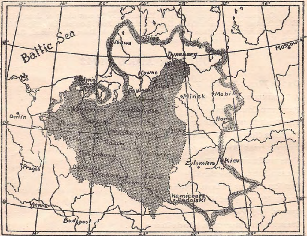
Map of Poland (the shaded boundary line indicates Poland's extension before 1772).