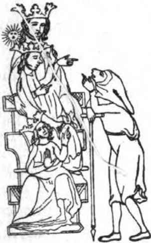
THE SCANDINAVIAN TRINITY.

In Thorpe's Northern Mythology (now out of print)