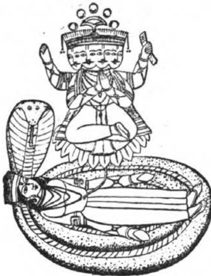
THE HINDŪ TRINITY

third person, in the form of a serpent. A wonderfully