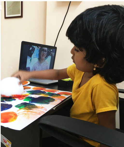
An LKG student tries a new painting technique