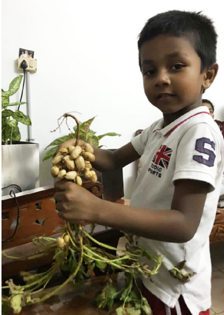
A student harvests groundnuts