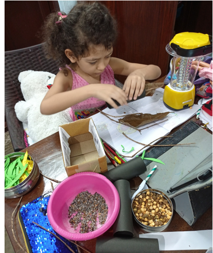
A student works alongside her classmates on the screen to build a Hotel for Bugs