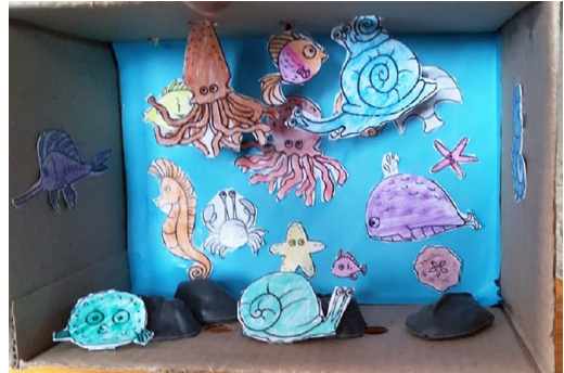
An "under the sea" diorama by our pre-KG student