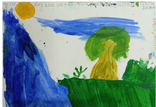
Nature Journaling, a weekly session of expression and creativity