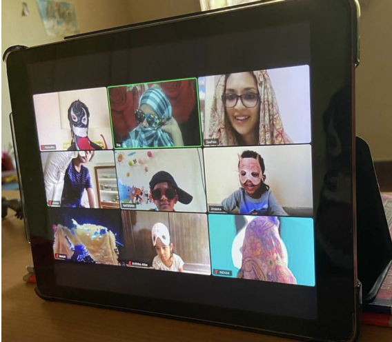
Snapshot of an online session. Students come dressed as their favourite characters ahead of Halloween