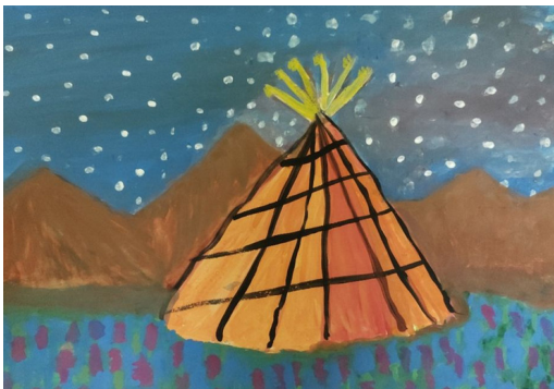
A student's rendition of a Tepee against a starlit sky