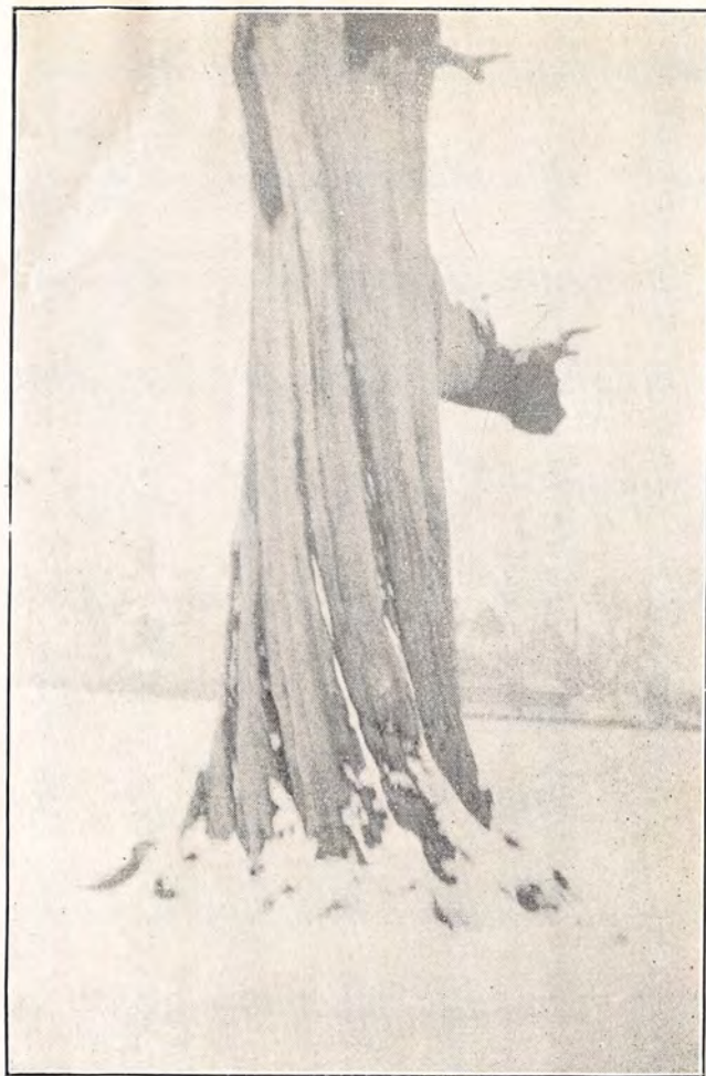
An old warrior: showing "stress and strain": near Epping Forest.