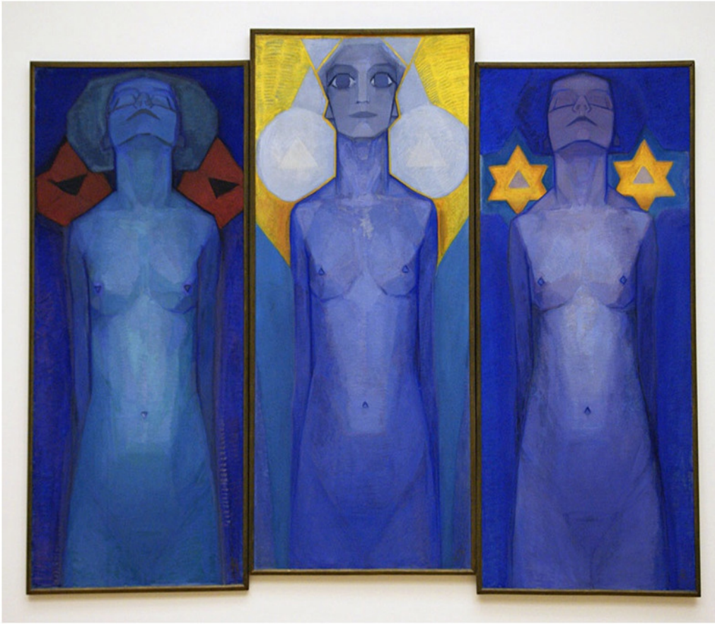
Piet Mondrian's triptych "Evolution"

and Abstract Painting 1890–1985 , 19 at the end of which a large picture of HPB is found, together with a two-page article on Theosophy. This stated categorically that her work had widely promoted occult teaching in modern times, popu-